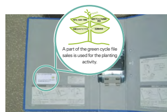
Build a system for in-house reuse of used files (green cycle files).

induced management standard value while another 5 exceeded the standards defined by the law. These issues have now been resolved.