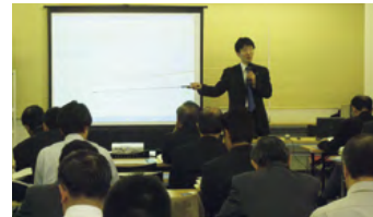
Waste risk management training session in progress

discharging waste. The EBARA Group intends to work out and carry out educational programs not only on compliance matters but also on a variety of environmental education issues.