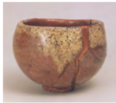
【Important cultural property】 Tea bowl, by Hon'ami Koetsu, known as "Seppou", Aka (red)-Raku ware. (Momoyama period)

< See the details at: http://www.ebara.co.jp/csr/hatakeyama/ >