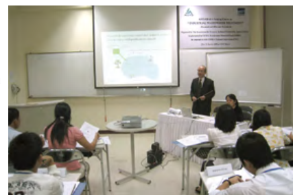
International course--training in Vietnam The training course received an overall satisfaction level evaluation of 6.4 (out of 7) from the trainees.

courses and workshops sponsored by the EBARA Hatakeyama Memorial Fund were launched, in which 9,329 students and engineers from Southeast Asia took part.