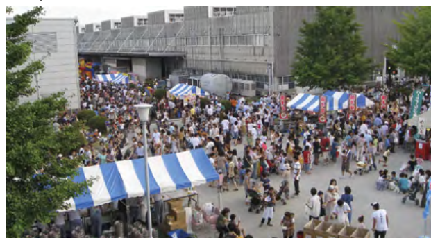
Fujisawa District Summer Evening Festival Held every August. In 2008, a total of 10,000 people in the area around Fujisawa came to the festival.

We intend to further disseminate the policies of local and social activities to promote continuous activities as the entire EBARA Group in the future.