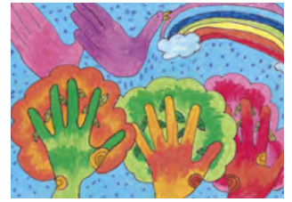
李汀岚 (age: 9)