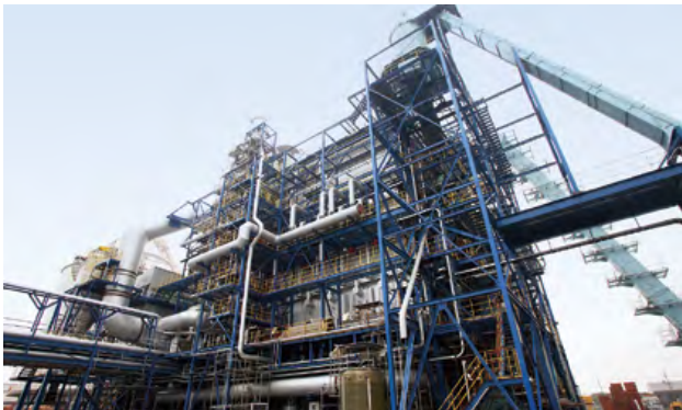
Internally circulating fluidized-bed boiler for biomass-fired power generation

The Environmental Engineering Company's business includes the engineering, procurement and construction (EPC *1 ) of facilities relating to water and waste treatment and their operation and maintenance (O&M *2 ). Its main customers are governments and other public offices and private companies in Japan and overseas. The Company's mission is to build infrastructure to support society and our daily lives such as water and waste treatment plants and maintain them in good condition for extended periods of time and to contribute to the establishment of a sustainable society by developing advanced technology.