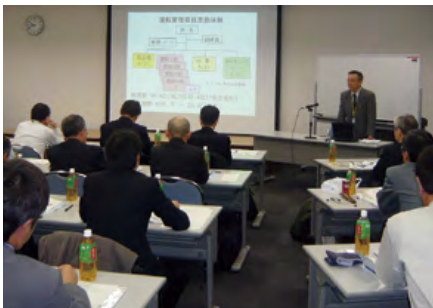
Management training for field office directors

At present, we are in the process of working out a plan for maximizing the effect of this organizational restructuring to improve customer satisfaction. As part of this plan, we are conducting questionnaire surveys on customers and analyzing the evaluation results to reflect them in all phases of our operations. To provide integrated services spanning from the procurement of materials through the operation and management of facilities, reconsideration of education for expanding employees' knowledge, which tends to be limited to their own fields, is also necessary. For this reason, we have held training sessions according to the hierarchical levels of the front-line employees including field office director training for the purpose of strengthening management ability. Enhancing the awareness of operators, who directly listen to customers' opinions on the front line, is also important for responding to customers' requests even more accurately. Accordingly, we are also moving ahead with the creation of a system that allows operators' opinions to be reflected in the engineering, procurement and construction