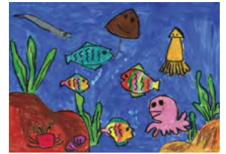
Min Sung Jun (age: 6)