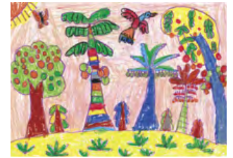
Pham Trung Kien (age: 9)

In 2009, we will continue to replace the remaining lighting facilities with energy-saving types. In Sodegaura District, 324 lamps in the plant were replaced with energy-saving lamps, which led to an annual reduction of 130 t in terms of CO 2 emissions.