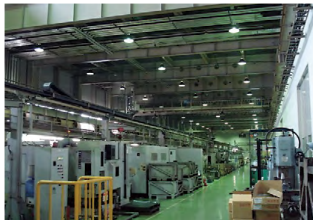
Plant in Fujisawa District with energy-saving lighting facilities installed

Energy-saving plant lighting facilities, which use reflectors and high-efficiency lamps, are capable of ensuring luminous intensity equivalent to that of the conventional facilities with only 40 percent of electric power consumption.