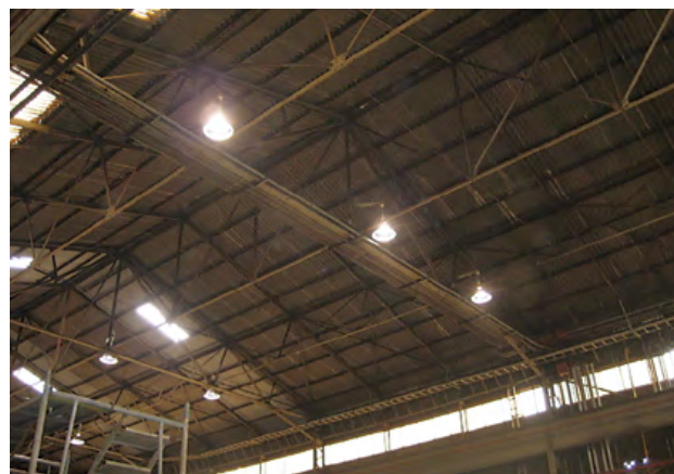
Plant in Suzuka District with energy-saving lighting facilities installed

At Suzuka District, where 90 percent of the CO 2 emissions are accounted for by electric power, 162 of the 285 lamps of the plant lighting facilities were replaced with energy-saving lamps, which resulted in an annual CO 2 reduction of approximately 23 t in the entire district.