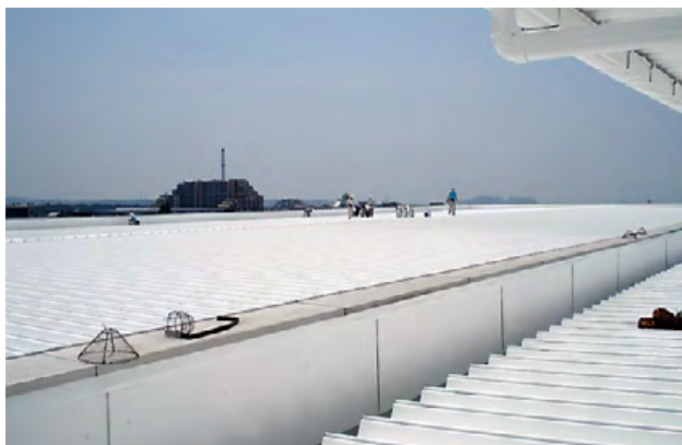
Application of heat insulating paint on the roof

Up to now, particularly in summer, the roof has been absorbing heat from sunlight, and this heat was transmitted into the air in the plant making the room temperature 1 m below the roof higher than the outside air temperature by more than 10°C. This caused an increased load on cooling systems and led to larger electricity consumption. After the application of heat insulating paint, the room temperature 1 m below the roof was controlled to approximately 5°C higher than the outside air temperature, which resulted in a decrease in air-conditioning energy consumption, or a reduction of 20 percent in terms of CO 2 emissions.